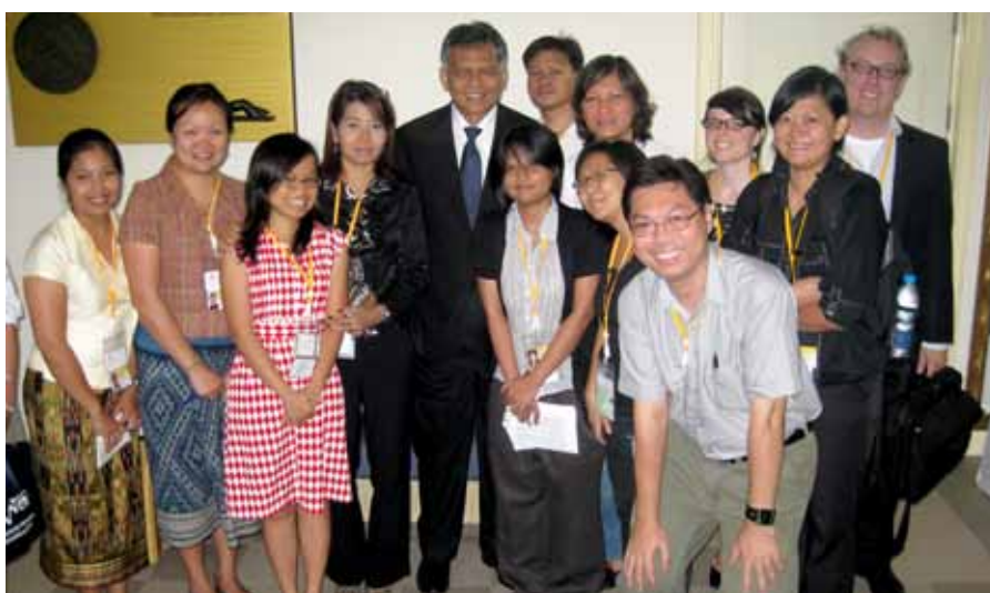
Secretary-General of ASEAN Dr. Surin Pitsuwan meets IJ alumni during an ASEAN conference in 2009 to discuss matters of regional integration.

Criticism has been in the air even ahead of the inauguration ceremony, especially with regards to the non-interference prin-